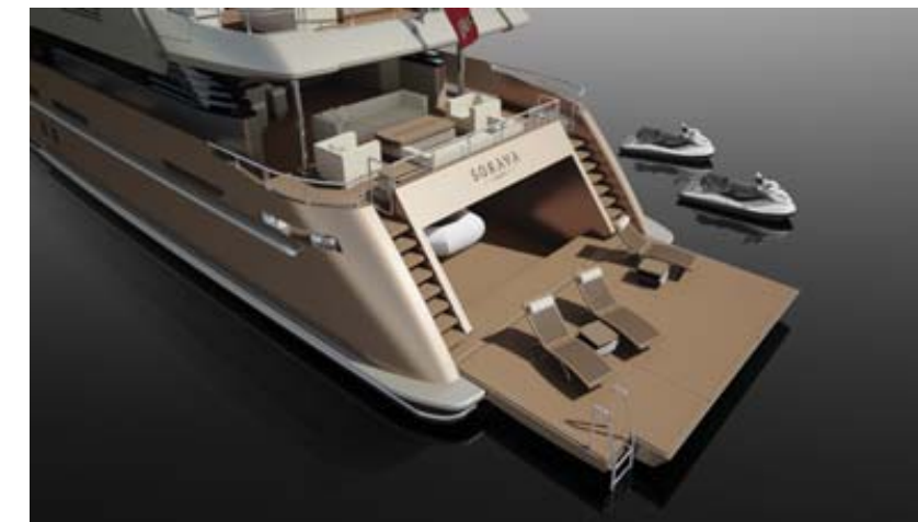
The swimming platform