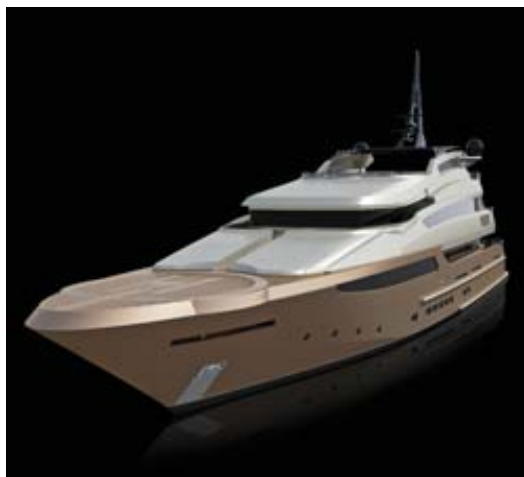
The Soraya profile