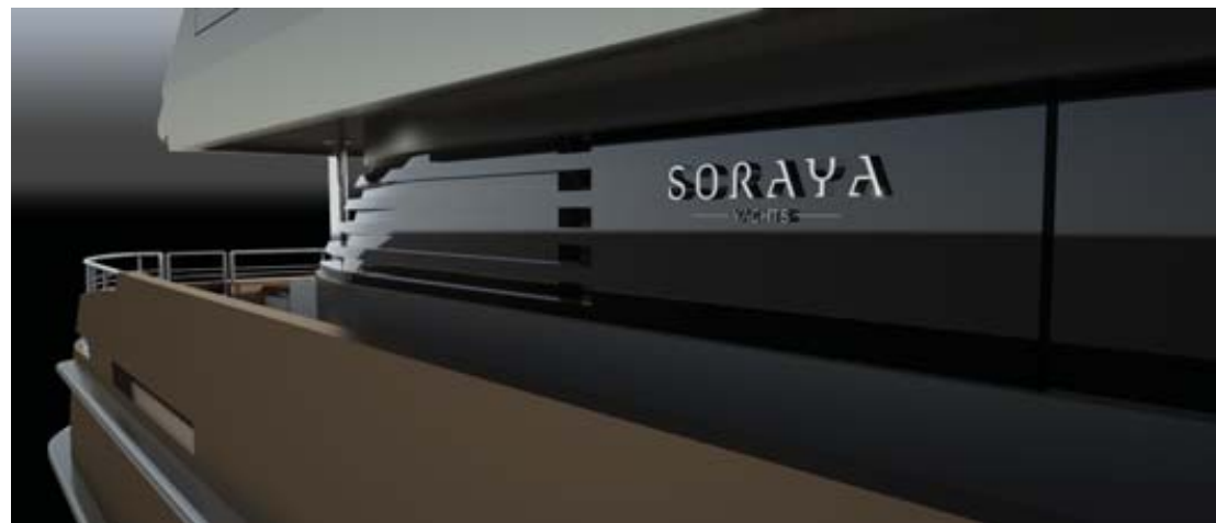
Soraya Yacht Detail