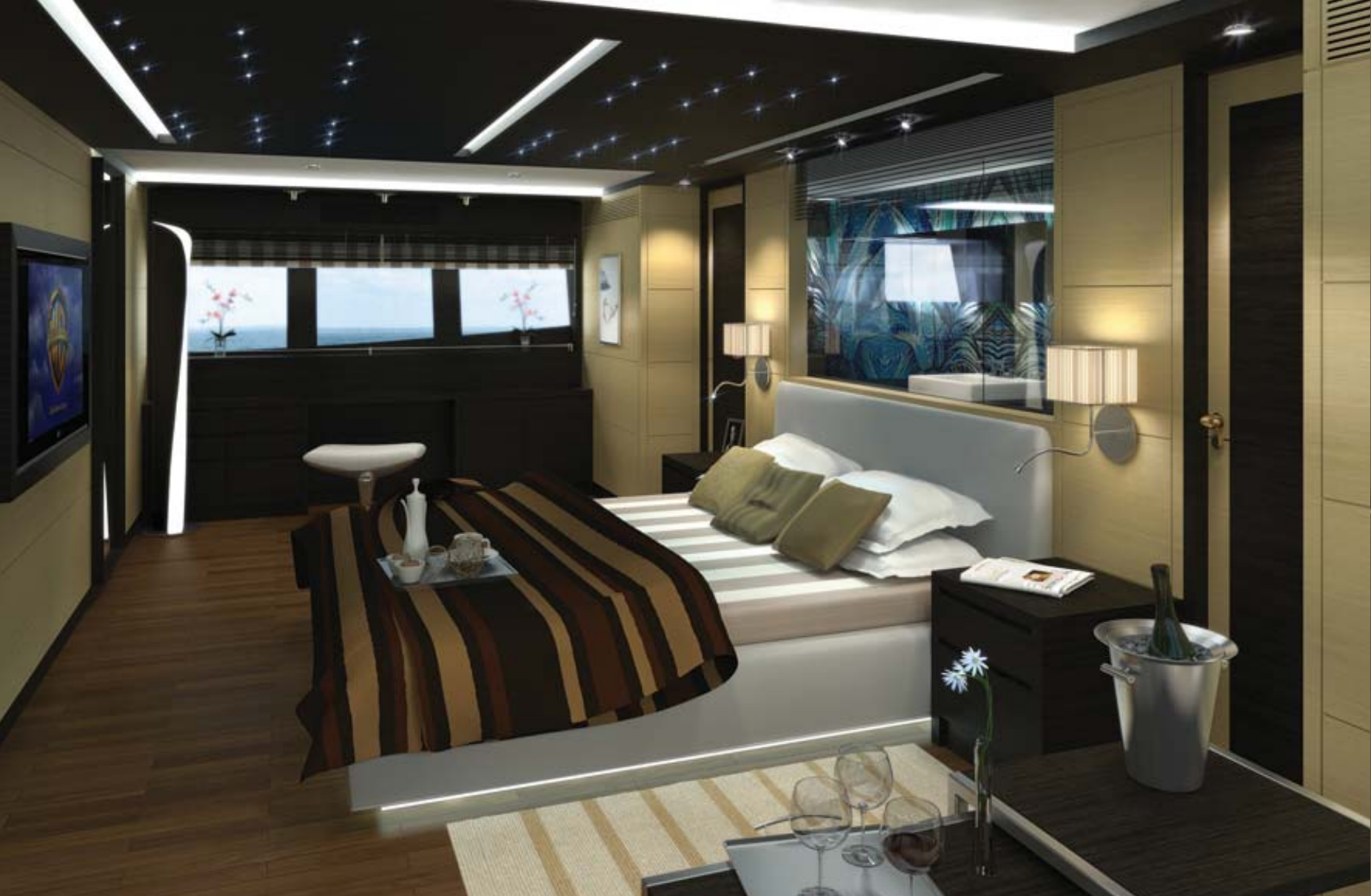
▲ The Owner's cabin ▼ The VIP cabin