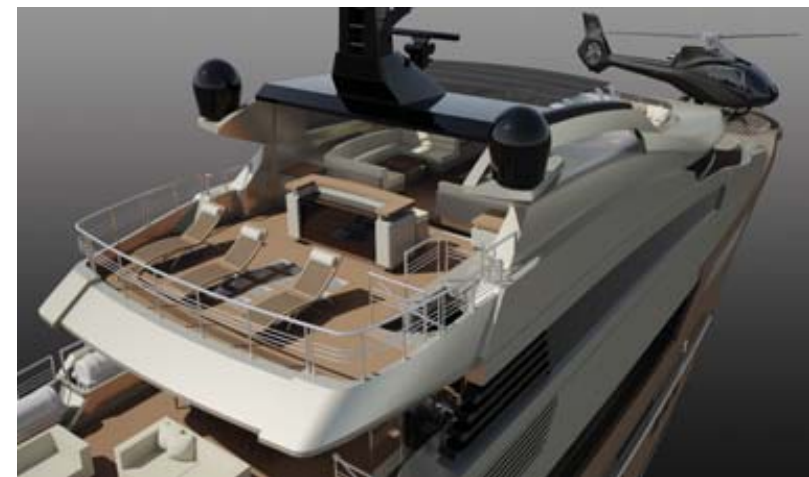
The sun deck