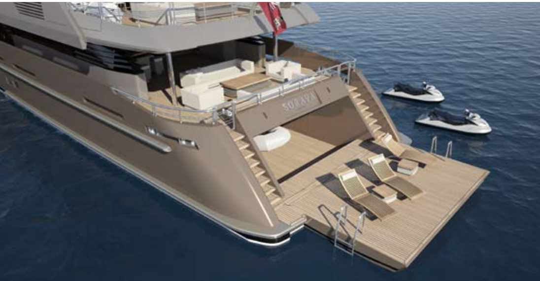
Above & Left: The Soraya 46’s spacious layout is comfortable and well-designed for both private family holidays and charter commitments.