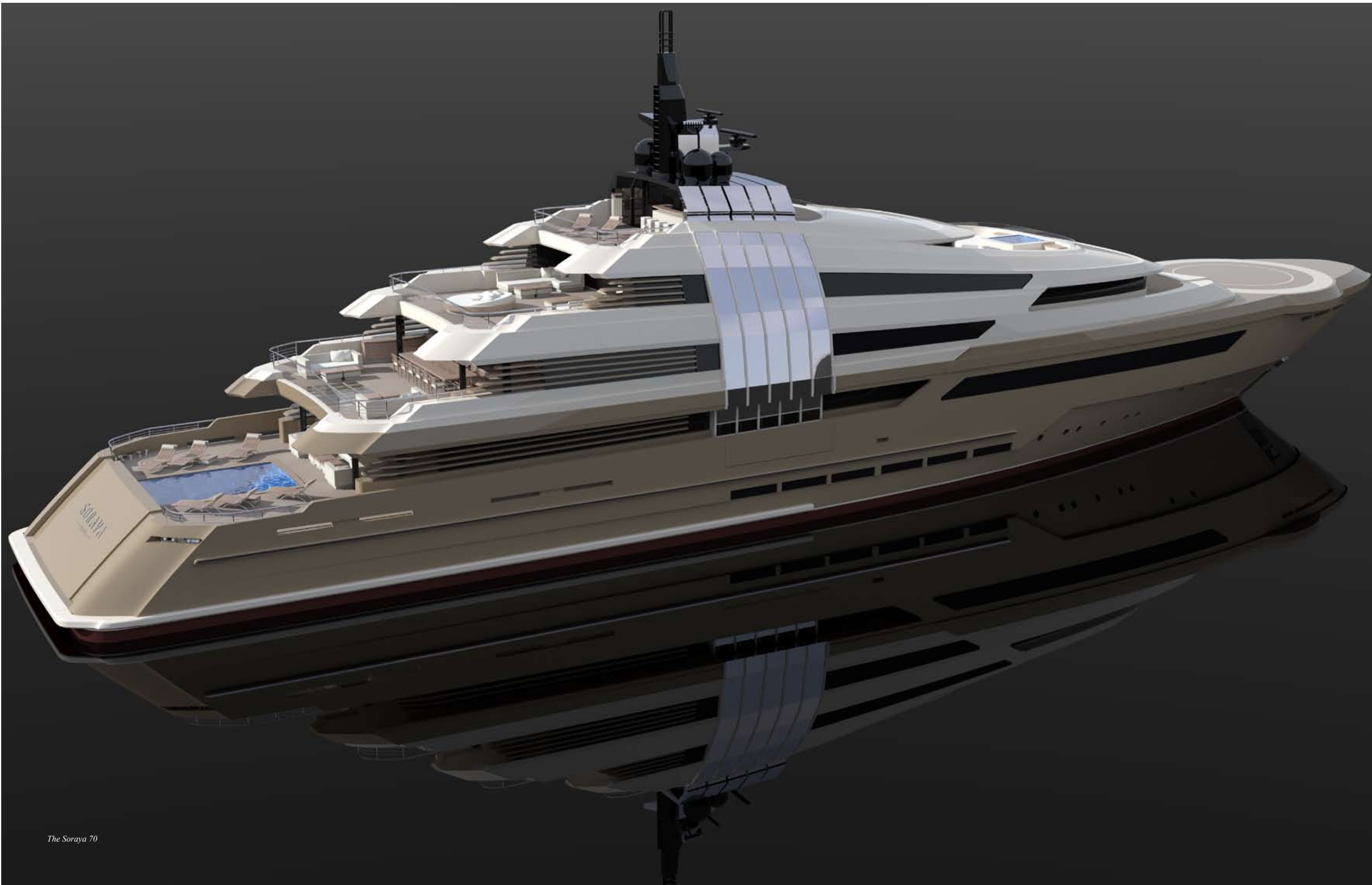
The Soraya 70