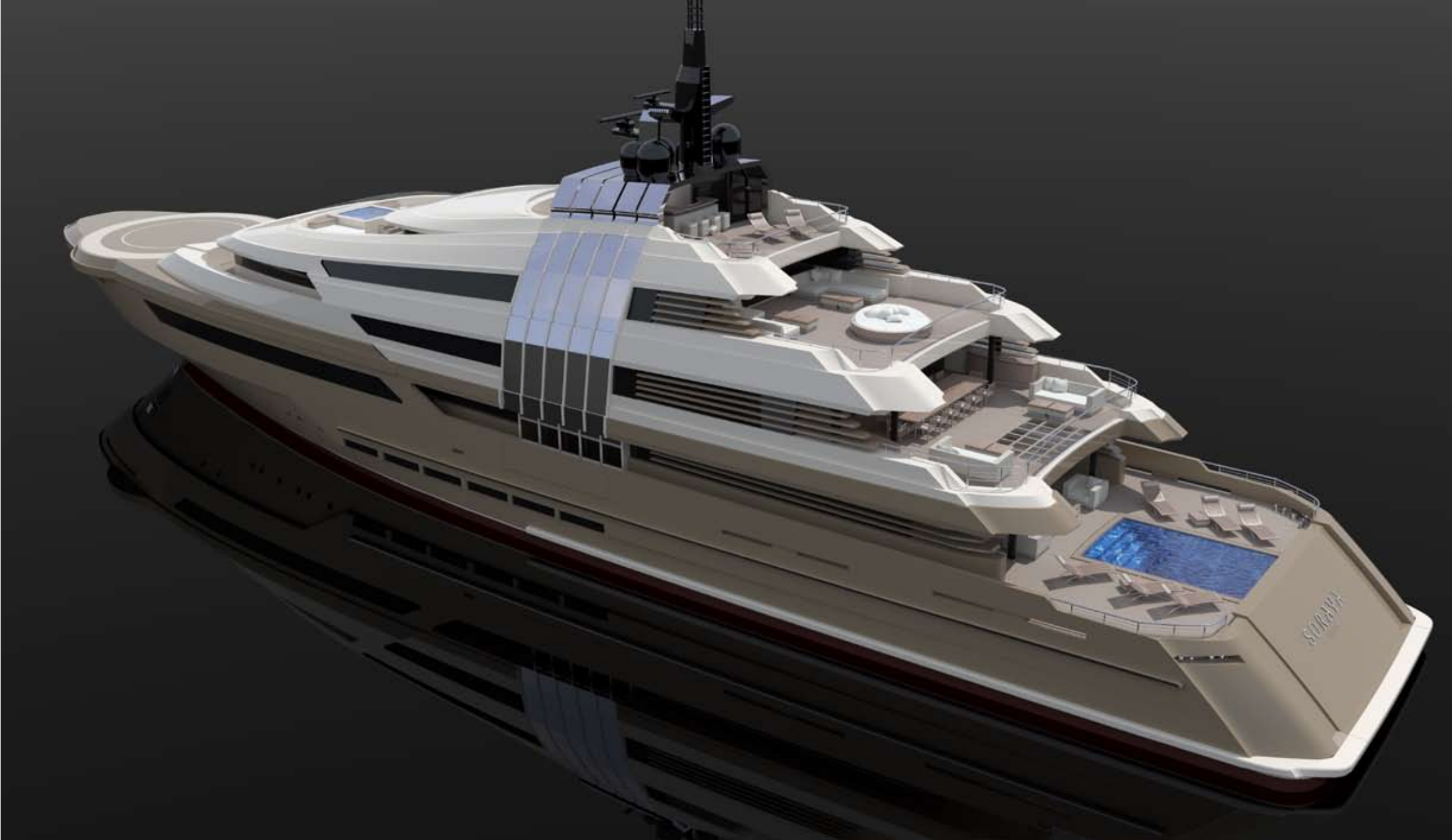
Right, Below & Overleaf: The Soraya 70 superyacht is another collaboration between Soraya Yachts and the Uniellé design studio led by Jure Bukavec.