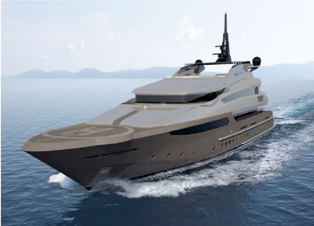
Above & Left: The Soraya brand of yachts is rapidly becoming a major force in the world of luxury yachting, with two stunning designs, the Soraya 46 (Left) and the new Soraya 70 (Above & Far Left).