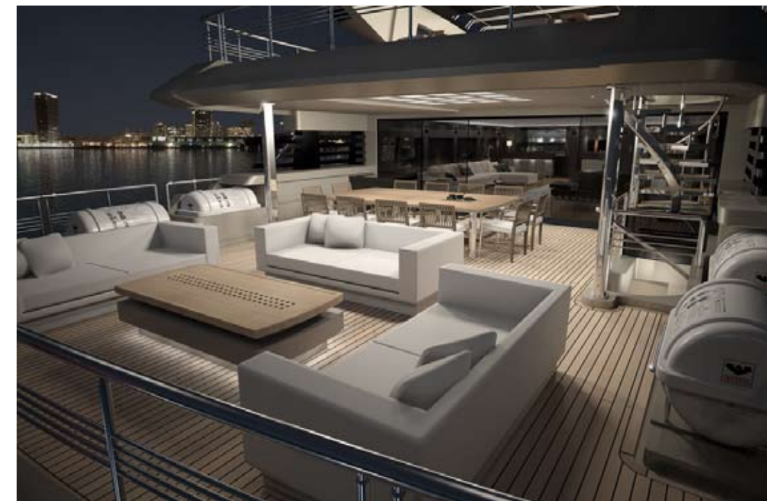
Above & Far Left: The Soraya 46 is the impressive result of years of planning and a worldwide collaboration of leading suppliers and contractors.