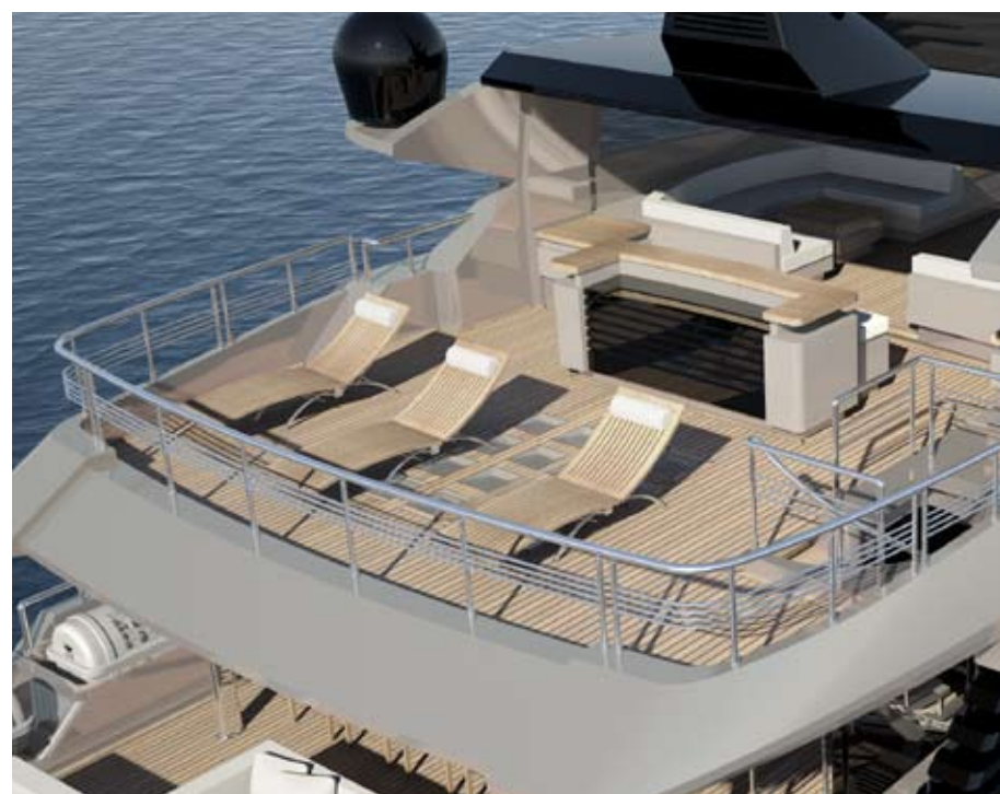
Right & Below: The main aft deck and upper deck are the main outdoor social areas of the yacht.

A truly modern yacht, the launch of the first Soraya 46 is certain to be eagerly awaited by yacht owners worldwide.